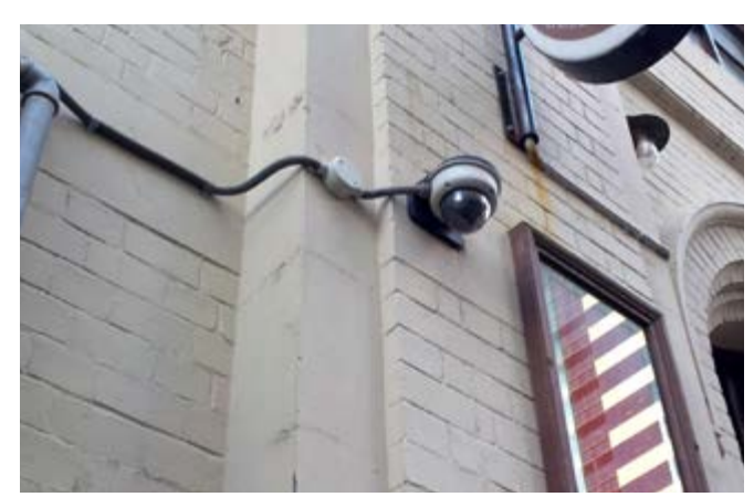
Example of CCTV surveillance at the entrance/exit of a bar

Security staff should be properly trained and certified for their role and possess good conflict resolution and crowd control skills. All security staff should have the proper valid certification and training as required by legislation. Where security staff are provided by a third party, licensees and managers should (on every shift) check the certification for each security staff member and keep a log noting the security staff member's name and certificate number.