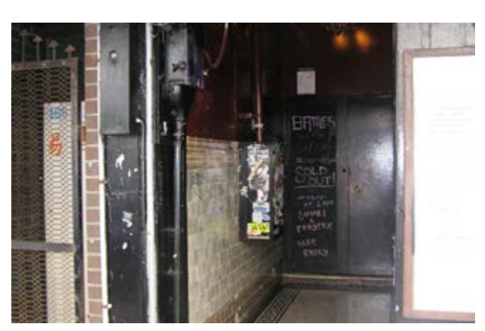
Example of poor entranceway to a nightclub