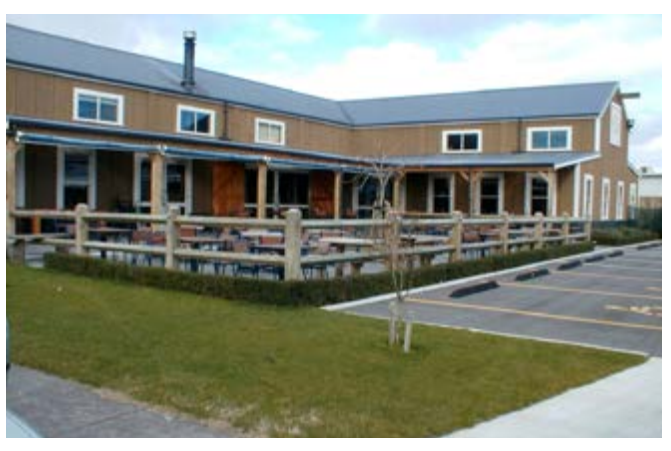
Example of a well designed outdoor drinking area