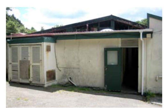
Example of unlit rear of a bar

Poor ventilation and inefficient air-conditioning contribute to the amount of heat in a drinking location. Heat can make patrons uncomfortable, heighten irritation, and lead to increased alcohol consumption. The consequence is increased risk of intoxication, aggression, social disruption and violence. Therefore, the premises should be well ventilated with effective climate control to prevent the premises from becoming too hot (or too cold).