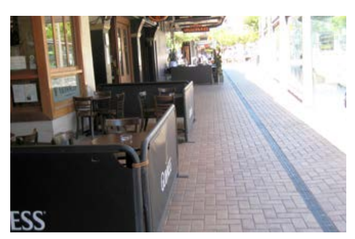
Example of good demarcation of outdoor drinking area